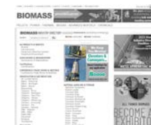
Bonus: Medium Rectangle Online Ad

BONUS: Receive 1 year FREE medium rectangle ad on Directory.BiomassMagazine.com with the purchase of a display ad.